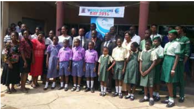
World Oceans Day Celebrations in Akure, Nigeria

As in previous years, the international jury selected the winners in three age groups, up to