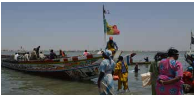
Fish landing in Guet Ndar, northern Senegal

Field work with semi-structured questionnaires and focus groups led by Aliou Sall in Senegal the previous year explored the views of hundreds of fishers and some traders. Based on these raw data, different types of analysis allowed to develop a series of presentations at international conferences and publications.