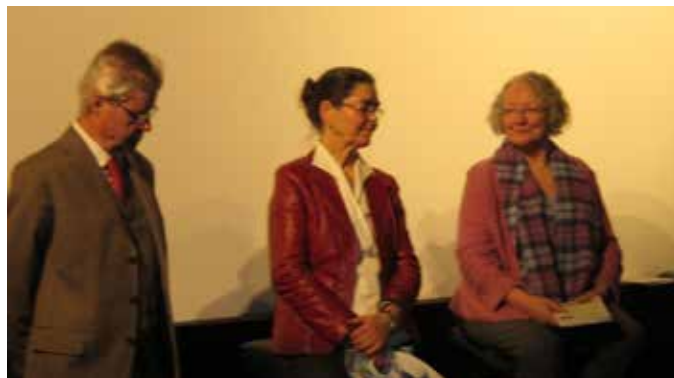
Panel on "Give the Ocean a Voice!"