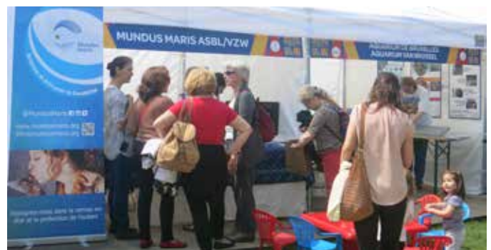
World Oceans Day Celebrations in Brussels, Belgium

The culmination of a lot of preparatory and outreach work for World Oceans Day were special events organised by Mundus maris and our partners in Brussels (Belgium), Douala (Cameroon), Mombasa (Kenya), Akure and Victoria Island (Nigeria) and Hann (Senegal). Thanks to the events, large numbers of people could get first-hand information about the ocean, participate in sports- and cultural programmes, beach clean-ups and more. Each event centred