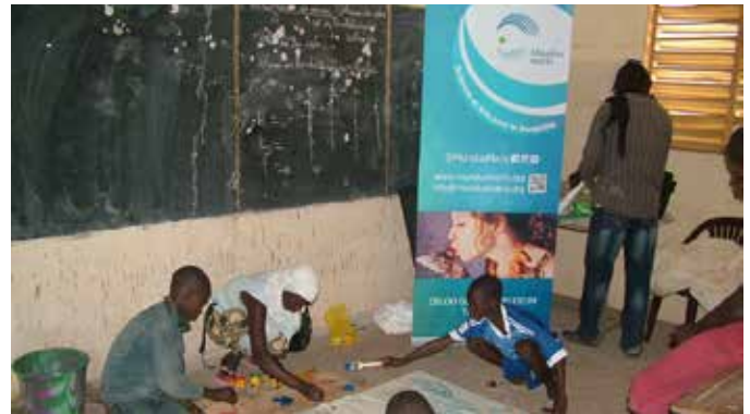
World Oceans Day Celebrations in Hann, Senegal

The culmination of a lot of preparatory and outreach work for World Oceans Day were special events organised by Mundus maris and our partners in Brussels (Belgium), Douala (Cameroon), Mombasa (Kenya), Akure and Victoria Island (Nigeria) and Hann (Senegal). Thanks to the events, large numbers of people could get first-hand information about the ocean, participate in sports- and cultural programmes, beach clean-ups and more. Each event centred