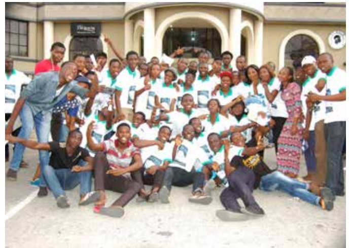
Green Me Film Festival Victoria Island Nigeria

the Green Me Global Film Festival celebrating its maiden performance in Nigeria, the group enjoyed the festival itself, both by viewing some of the world-class films and informing visitors about ocean issues. The gala was the highlight at the end with the Awards Ceremony for the winning films. Great emotions around the sustainability challenges " Ocean, Life, Water "!